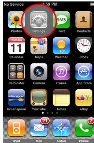
Figure 1: "Settings" button.