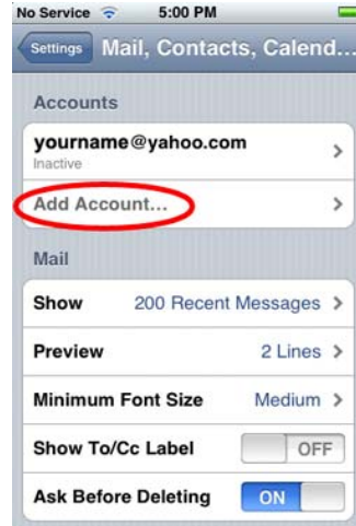
Figure 3: “Add Account...”