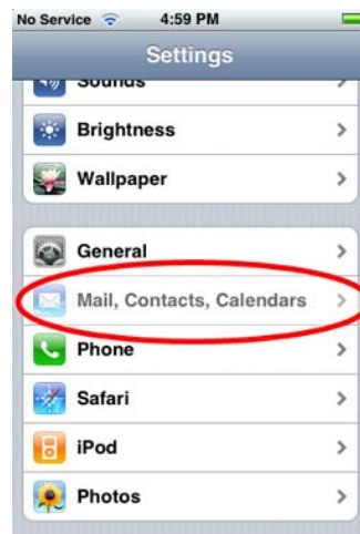
Figure 2: "Mail, Contacts, Calendars"