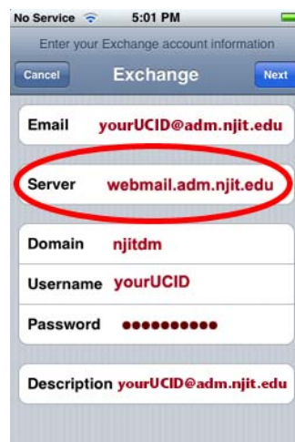
Figure 6: Enter “Server” information.