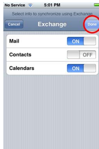
Figure 7: “Selecting info to synchronize using Exchange”