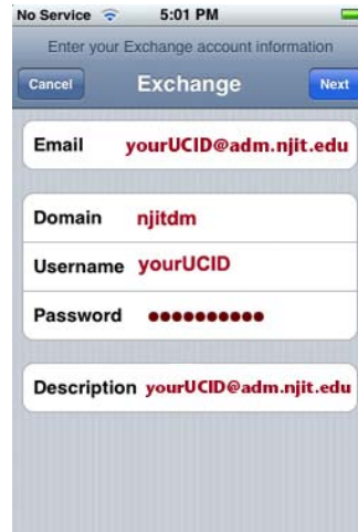
Figure 5: “Enter your Exchange account information”.